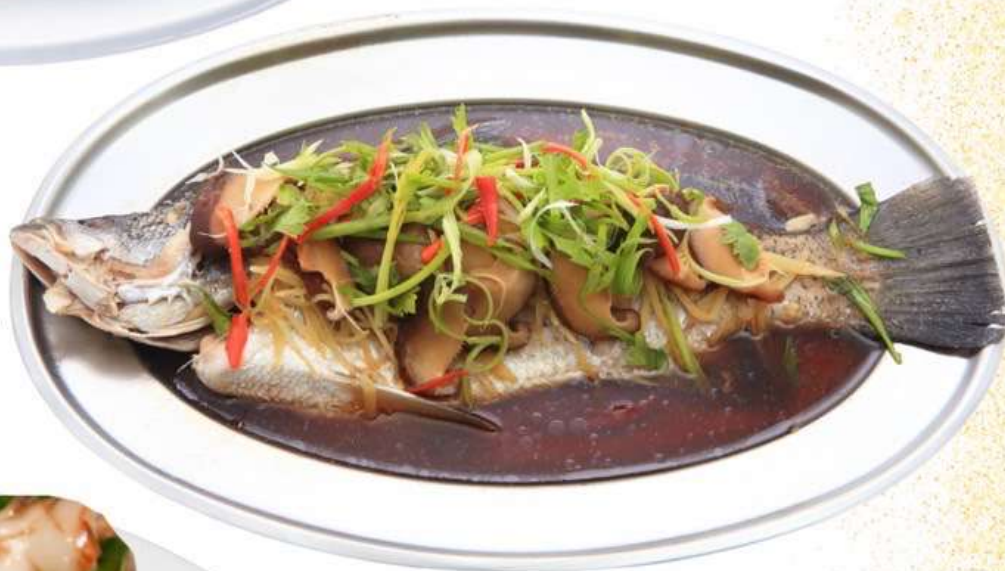
醬油蒸魚 Snapper steamed with soy sauce 450