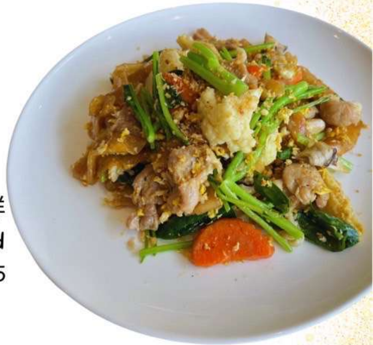
炒醬油、豬肉/雞肉/海鮮 Stir-fried soy sauce with pork, chicken or seafood 145/165