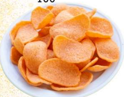
炸蝦餅 Fried Shrimp Crackers 100