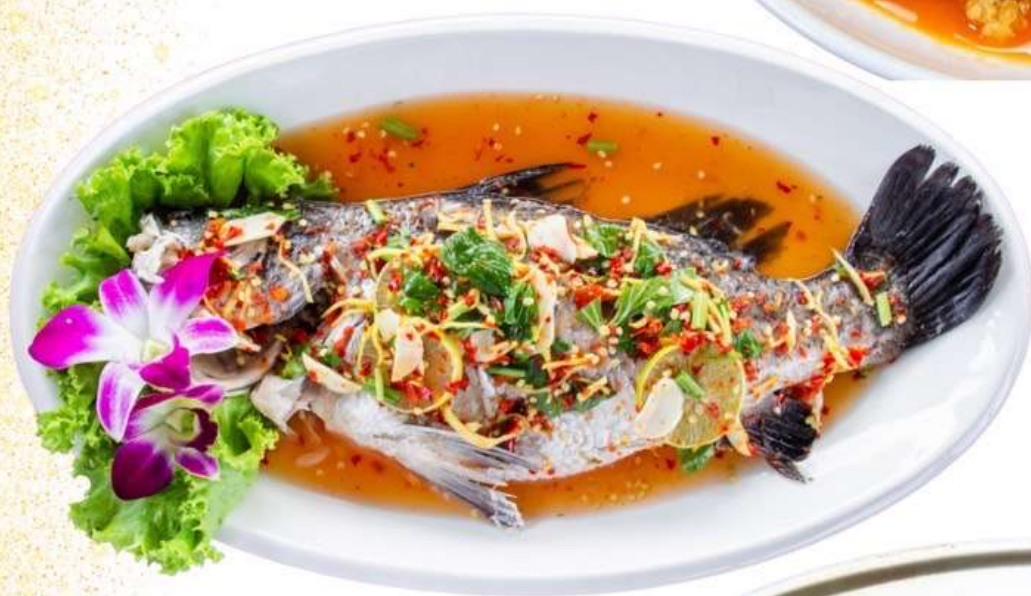
檸檬蒸魚 Steamed Seabass with Lime and Chillies 450