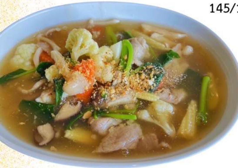
河粉片打鹵面，豬肉/雞肉/海鮮 Noodles with gravy, pork, chicken or seafood 145/165