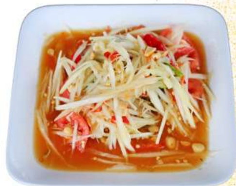
泰味木瓜沙拉 Thai Papaya Salad 120