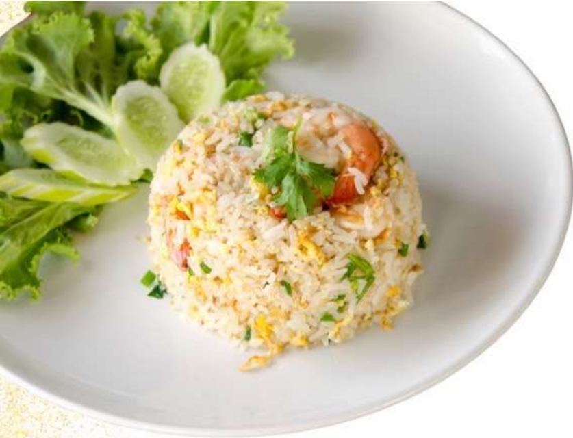
炒飯、豬肉/雞肉/海鮮 Fried rice with pork, chicken or seafood 145/165