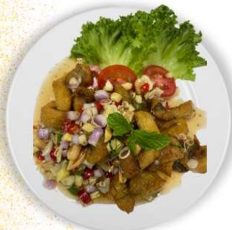
草本古拉米沙拉 Spicy Crispy Gourami Fish Salad 250