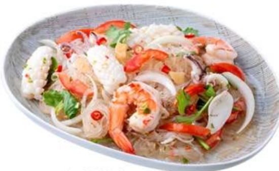
海鮮冬粉沙拉 Spicy Vermicelli mixed seafood salad 250