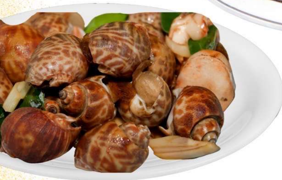
蒸甜蚬草本植物 Steamed Spotted babylon with herbs 250