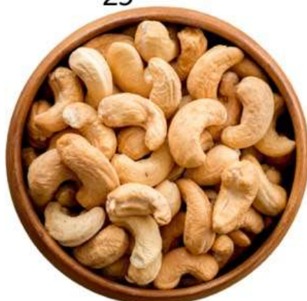
炒腰果 Fried Cashew Nuts 140