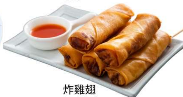
炸雞翅 Fried Chicken wings 140