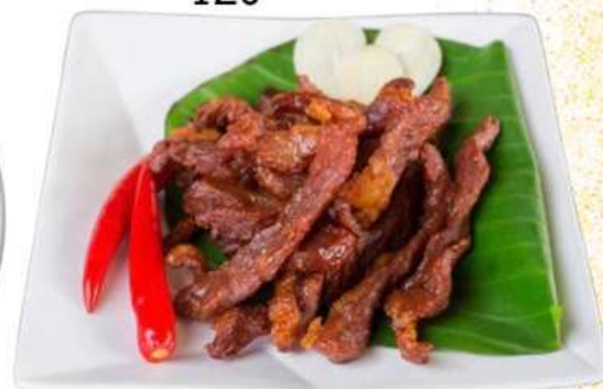
炒臘肉 Deep Fried sun-dried pork 140