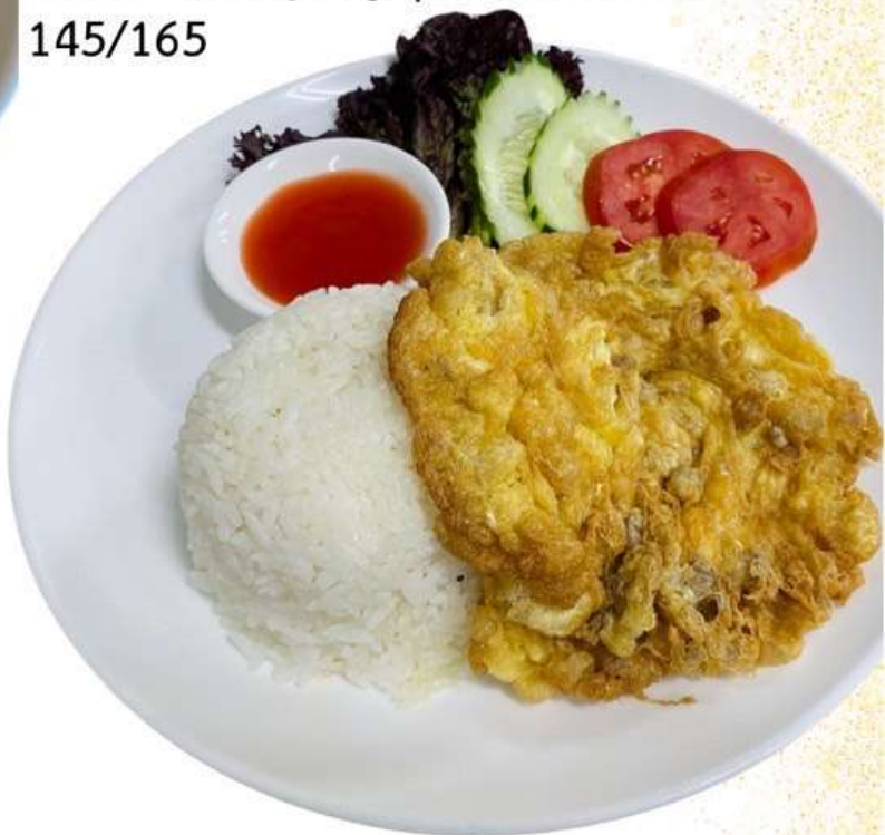
肉碎煎蛋飯 Minced Pork Omelet Rice 140