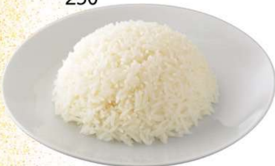
米饭 Steamed rice 25